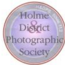
Photo Society Meetings