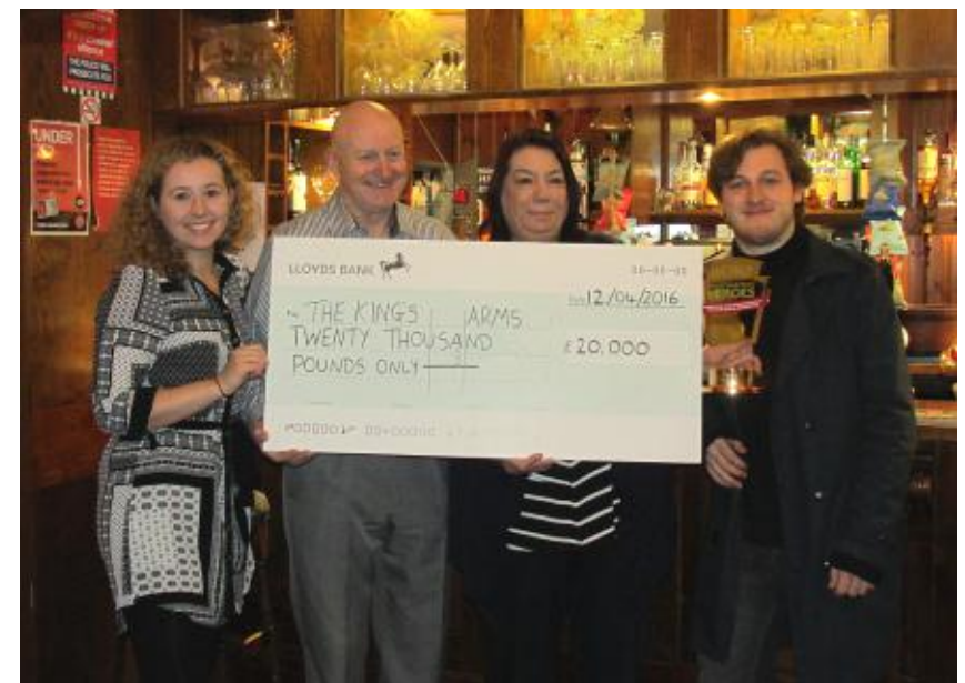
Left: The Trophy!