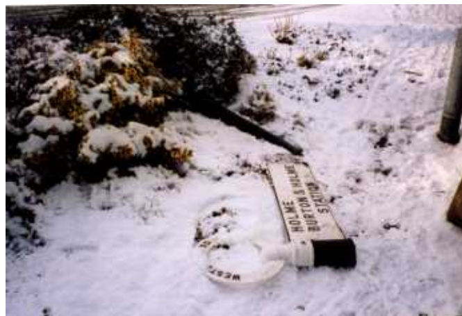
Photo 5 (top of next column) was taken on the 3 March 2006 after a vehicle

skidded across the road and broke the signpost at the base.