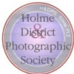
Photo Society Meetings