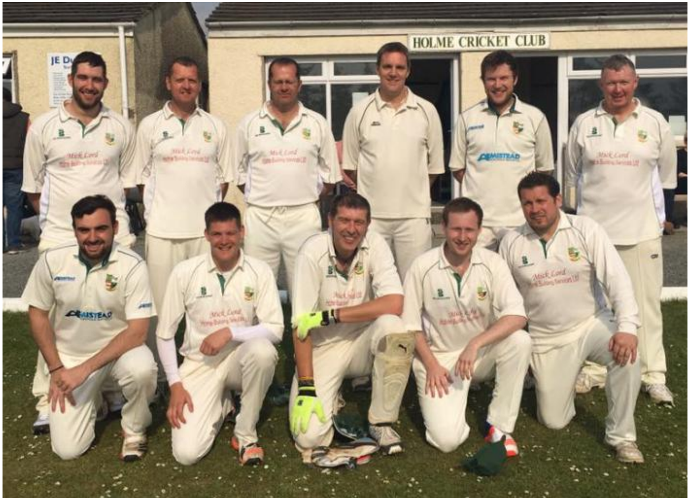
Holme Cricketers outside the Pavilion

be held at the Holme Social Club on 1 October. In addition there is a Fashion Show being run on behalf of Club funds. This is being held at the Holme Parish Hall on Thursday 3 November from 7.30. There will be an opportunity to get up to 75% off brands such as River Island, Oasis, Miss Selfridge, Evans, Next, Wallis, Topshop, M & S, Debenhams and New Look.