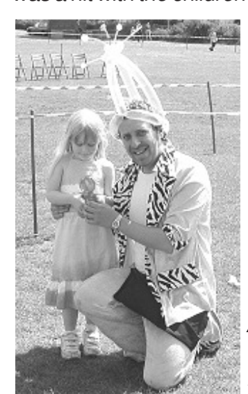
Above: "Major Tom" with "ground control" in the Parade