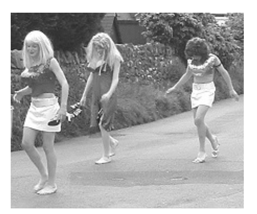
Some of those who took part on Burton Sports Day in May.

Do you recognise yourself? We had a hard time seeing who's behind most of the costumes.