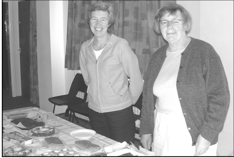
Left - BADS catered for the visitors, and if you liked what you nibbled you could buy the recipe!