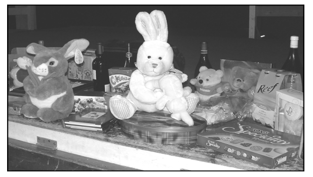
Above - Raffle prizes waiting to be won

Right - Holme & District Local History Society behind their Plant Stall