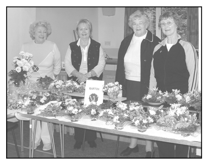
Above - The W.I. with their wonderful stall of flower arrangements

Right - Holme & District Local History Society behind their Plant Stall