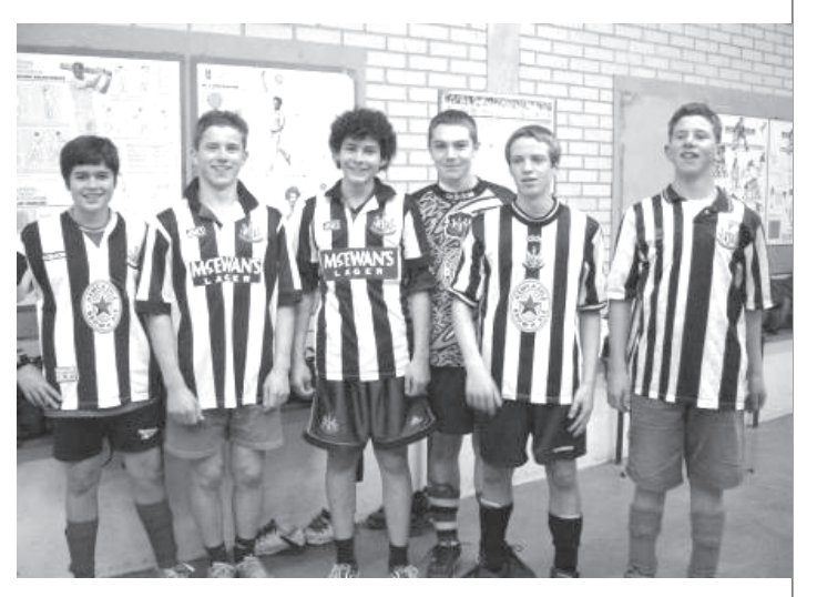
Well done to all!

Success for the Senior Team at Southport, through to the Second Round.