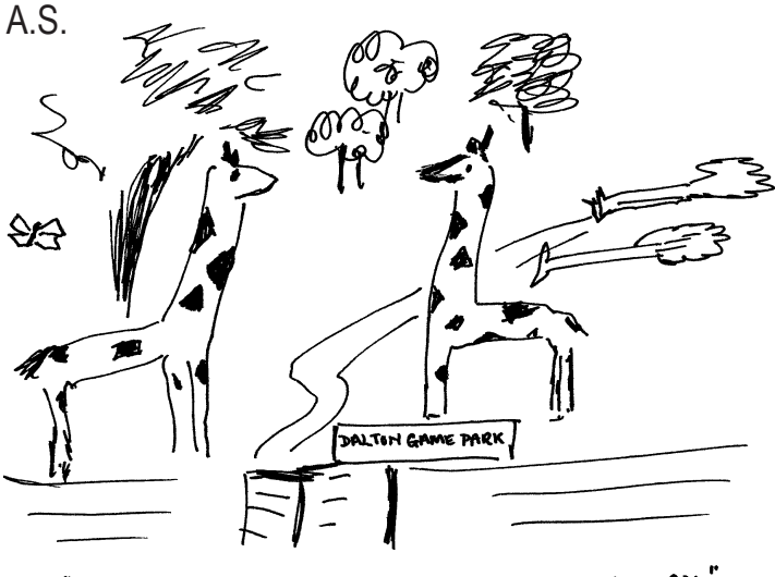
WE'LL SOON HAVE THESE TREES UNDER CONTROL"

Unable to be resolved at the meeting was the query, raised by "a member of the public", as to whether the PC had any information about the hearsay that Planning Permission was being sought from Lancaster for the construction of a marina at Tewitfields, apparently together with 50 houses. The Clerk is to make enquiries. One PCIIr has the plan for a Farm Shop development at the Tewitfield farm, which he is to circulate amoung PCIIrs.