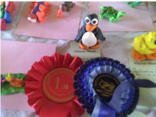
Zach Thomas's plasticine winning Penguin

From memory it made £10 which at less than 10p per pound is really good value. The lump now on the floor (the pumpkin) had to be moved and farmer