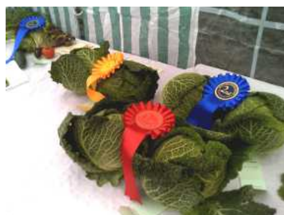
Left: Alan Jackson's display of 5 vegetables. Right: Peas in pod Savoy cabbages. Judging is tough sometimes when they are so similar!