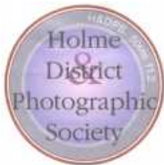
Photo Society Meetings