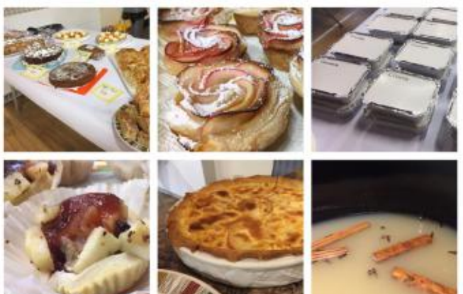
Our tasty apple dishes went down well both savoury and sweet ones!

SPOTTED DOG CHILDREN'S CENTRE CLAWTHORPE HALL BUSINESS CENTRE Tel : 01524 784321