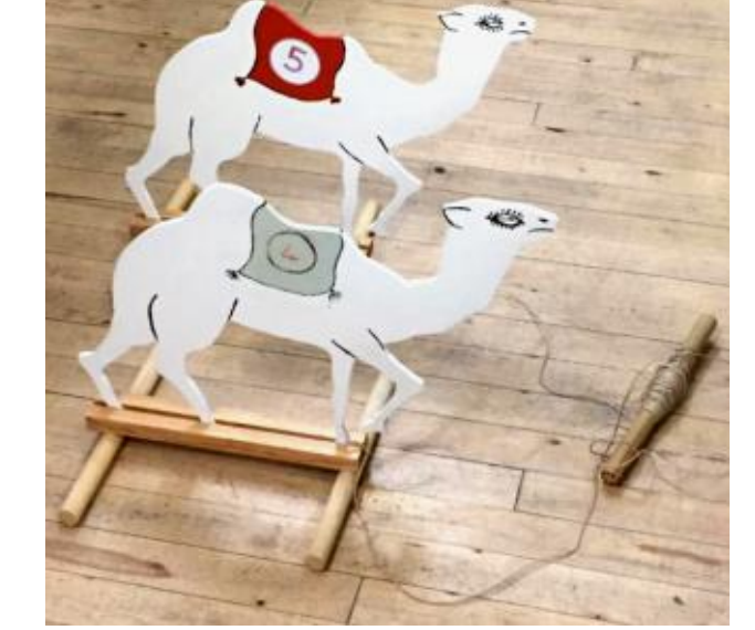
Did you think they meant real camels, in a village hall?!

Finally, it is expected that the ground improvement work will begin in November. Hopefully, will have we complete everything the new by season.