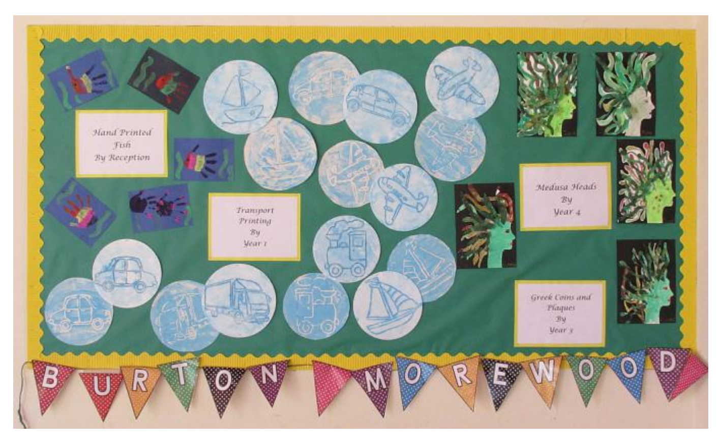
Above and below left:

The artwork panels by the children of Morewood School on display at the Memorial Hall