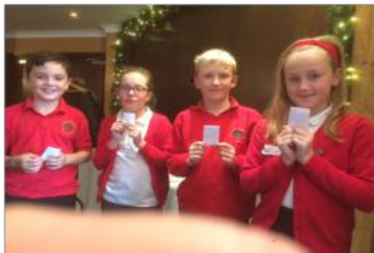
SLPP members with their voting slips

The following week was the first meeting of the year for our South Lakes Pupil Parliament gathering. They had a packed day, meeting other primary school members and were very fortunate to have Tim Farron as their guest speaker. After lots of healthy debate, the Parliament voted on Pollution Challenges for their focus for their meetings in spring and summer next year.