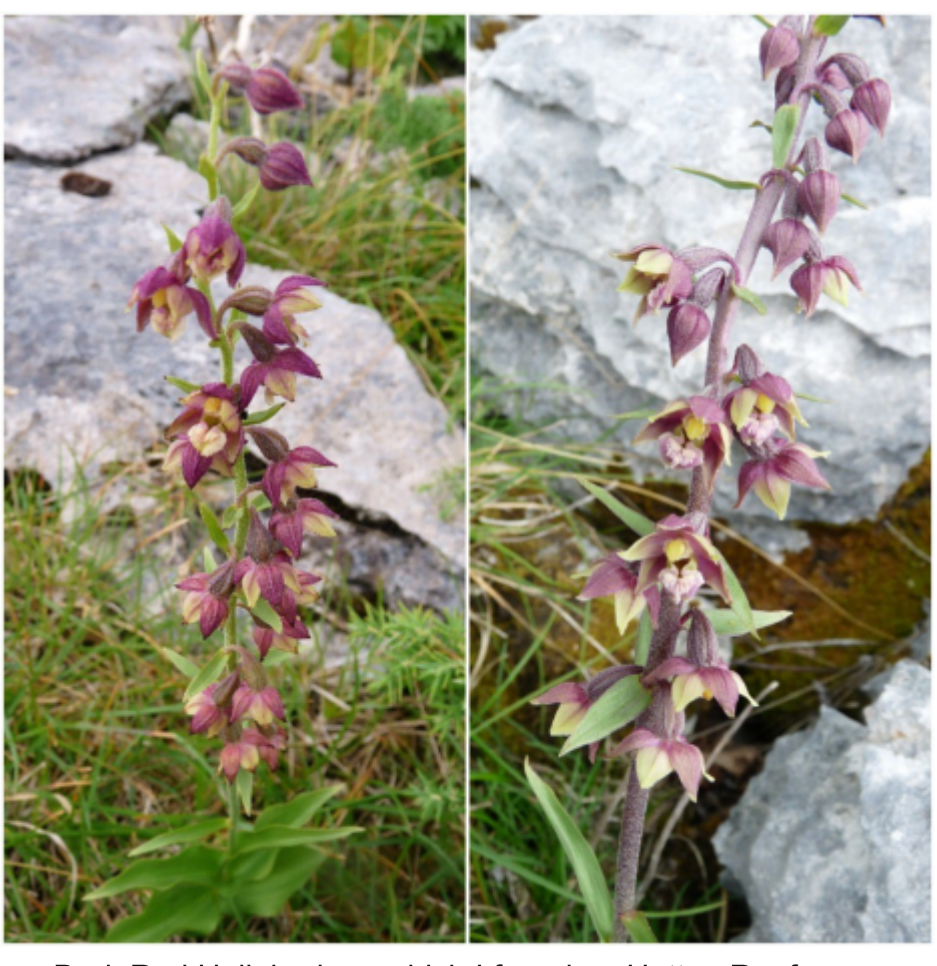
Dark Red Helleborines which I found on Hutton Roof

I LOVE ARNSIDE AND SILVERDALE: https://arnsidesilverdale.blogspot.com/ A day to day blog about the nature especially on Hutton Roof THE ORCHIDS OF HUTTON ROOF: https://epipactisatrorubens.blogspot.com/ My photos and study notes in relation to the Orchids of Hutton Roof THE FLORA OF HUTTON ROOF: https://floraofhuttonroof.blogspot.com/ My photos and study notes in relation to the Flora of Hutton Roof THE FERNS OF HUTTON ROOF: https://huttonroofferns.blogspot.com/ My photos and study notes in relation to the Ferns of Hutton Roof.