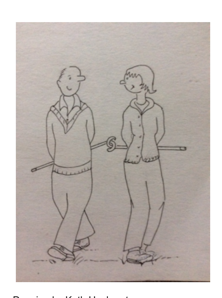
Drawing by Kath Hayhurst