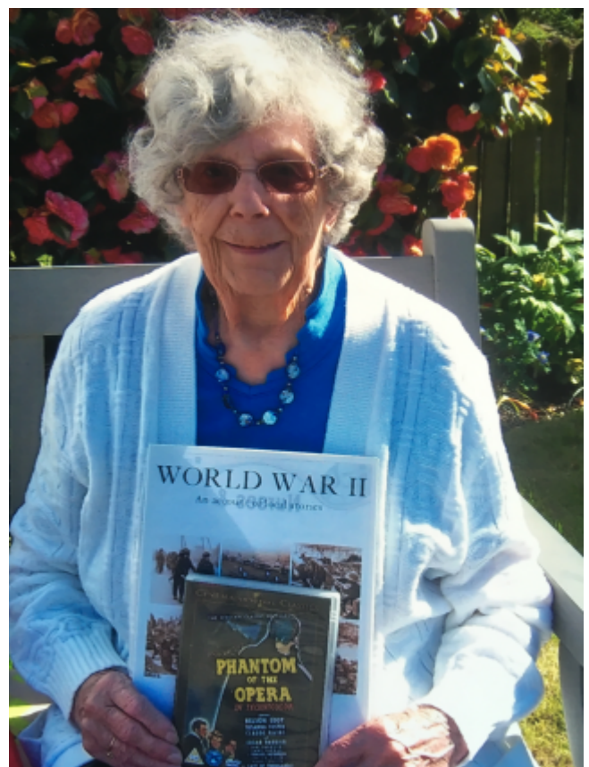
May on VE Day Anniversary