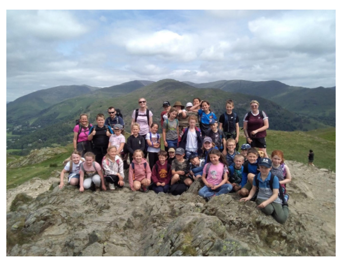
Year 4 on Loughrigg!