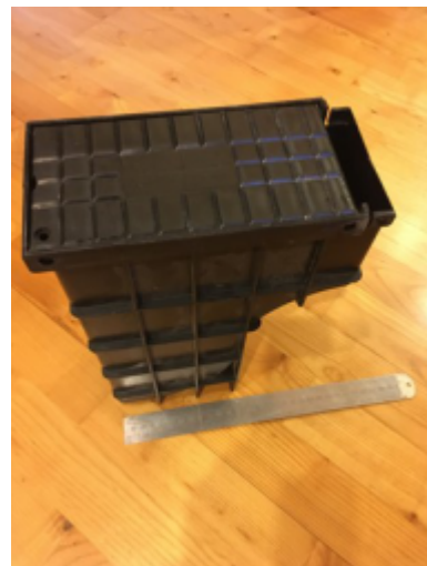
Box measures 190mm x 100mm

The second option means that we will need a lot more volunteers to help get residents connected promptly. If you feel you can help we will provide full training and guidance. Please contact me at: postmaster@martinsansby.plus.com