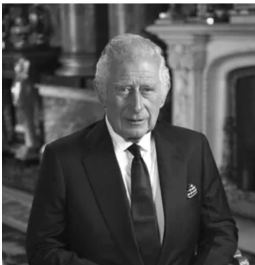
King Charles III