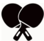
Table Tennis Club