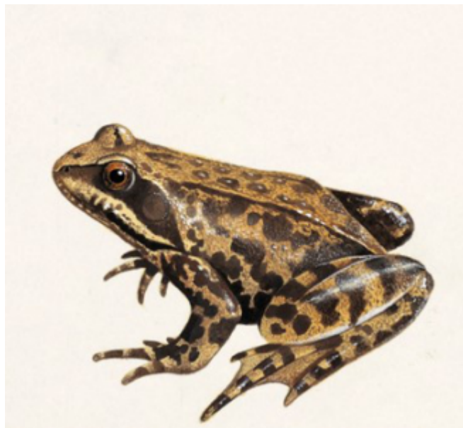
A common frog