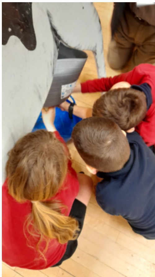
Year 5 pupils try their hand at 'milking' in the classroom