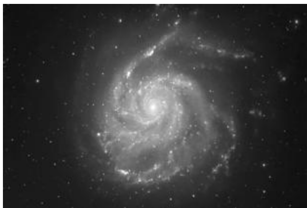
Pinwheel Galaxy Photo S Thexon

Spiral galaxies, like our very own Milky Way, look similar to pinwheels. These galaxies tend to have a bulging centre heavily populated by stars, with elongated, sparser arms of dust and stars that wrap around it. Our galactic neighbour, Andromeda (also known as Messier 31), is also a spiral galaxy. Do consider here, the shape we perceive is also dependent on our viewing angle. If you look at a Frisbee from above or below it is perfectly round whereas from