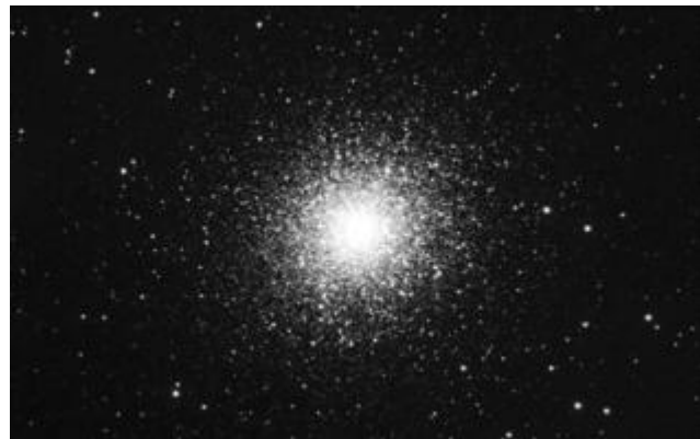
Globular Cluster

Irregular galaxies are, well ... a bit strange! They have unique shapes, and many just look like messy blobs. Astronomers think that irregular galaxies' uniqueness is due to interactions between galaxies, like collisions. Galaxies are so big, with so much distance between their stars, that even when they collide, their stars usually do not hit each other. However, clouds of gas, dust, and stars are violently thrown around, forming an entirely new, larger galaxy. This could be the cause of some irregular galaxies seen today. While some just look like a blob of stars and dust, others form dazzling ring galaxies. It is thought these may be a product of collisions between small and large galaxies. These collisions cause ripples that disturb both galaxies, throwing dust, gas, and stars outward into dramatic rings.