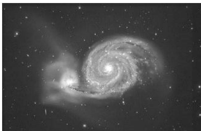
Whirlpool Galaxy A collision in progress?