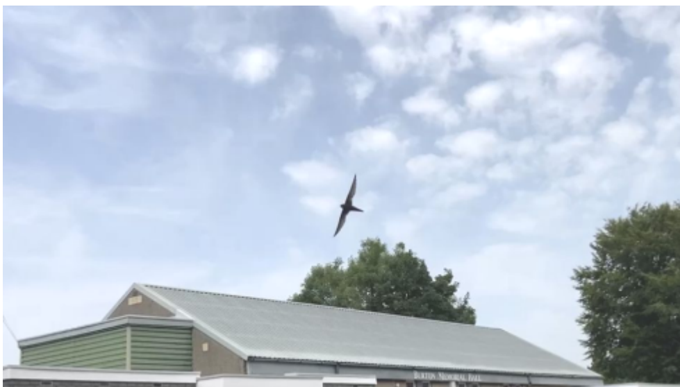
A swift screams past Burton Memorial Hall in 2022