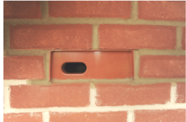
Swift brick by Barratt Developments

You can help swifts by avoiding renovation work when they are nesting and by leaving existing nests and their access holes undisturbed, to ensure the birds still have access to nest sites after any renovation work.