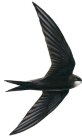
Swift by Mike Langman (rspb-images.com)

For me, their appearance in May announces the start of summer. Not that summer often means much in this part of the world. But regardless of whether the Sun is actually shining, they show up. Swifts show up to let us know that it is getting warmer (you don't need your big coat now) and that behind the clouds, there is definitely some sun. Swifts show up, following an incredible journey from Africa, where they wisely go to spend the winter months, away from the generally relentless rain and cold in Burton. They come here to raise their families. They choose their seasonal home among us humans.