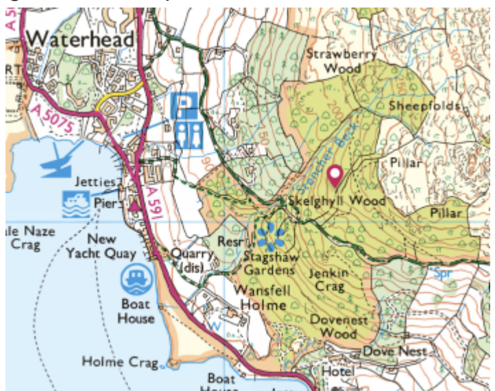
Map extract of the walk area

From the Stagshaw Garden car park you can easily find your way down to the A591 and follow the footpath back to the Waterhead Car Park.