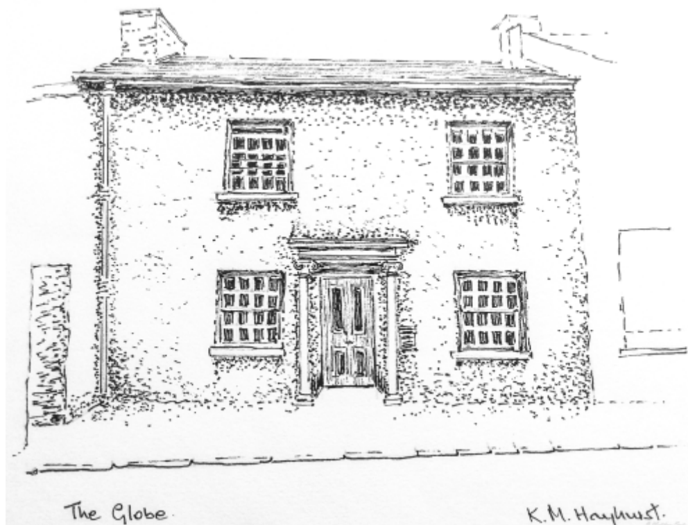
The 'Globe', as described in this drawing, was formerly the 'Cross Keys'

To feed the villagers, 4 grocers, 3 butchers and 2 bakers. Other occupations included a postman, an excise officer, a wharfinger, a tanner, a twine manufacturer and a gardener/seedsman.