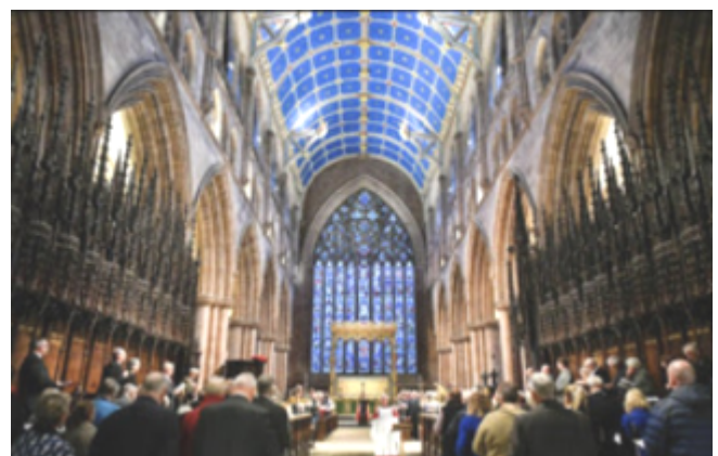
Images of the Service