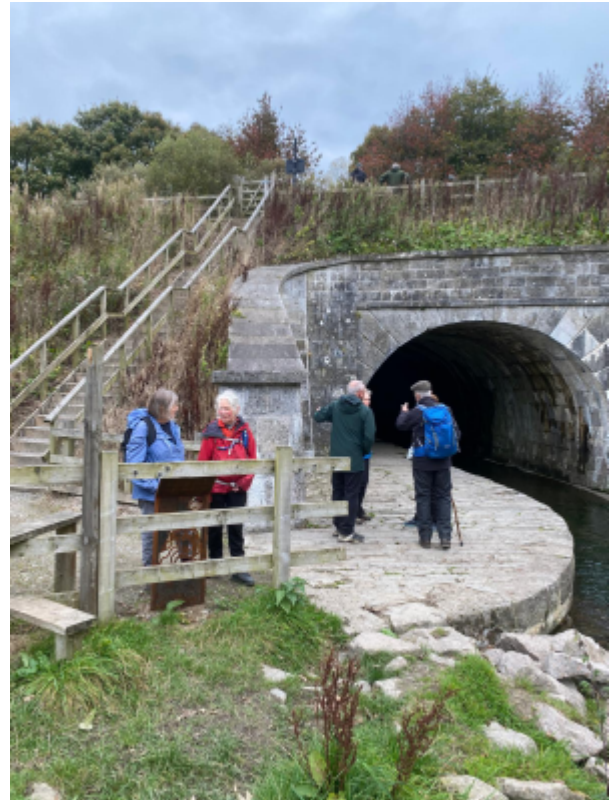
Inspecting Stainton Aqueduct

We got onto the canal banks at bridge 167 and turned left. As we strolled along one of our party relayed several interesting facts about the history of the canal, in particular the milestones. We made a brief stop at Stainton Aqueduct, where we were informed of the extensive repairs that were made after Storm Desmond did his worst. This aqueduct is a real feat of engineering, as are many other aspects of the waterway.