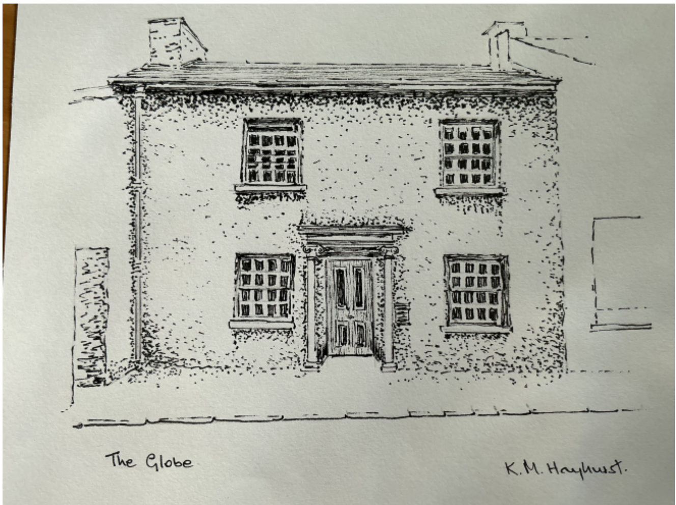
The Globe (Formerly the Cross Keys Inn)

The afternoon was spent in good humour and conviviality, during which many excellent toasts and songs were given; twenty-two stout and healthy young men enrolled themselves as members. Though this Society is yet only in its infancy, it bids fair to outstrip all similar Societies in this part of the country, being founded on a basis and conducted on a principle, that cannot fail to insure its prosperity.