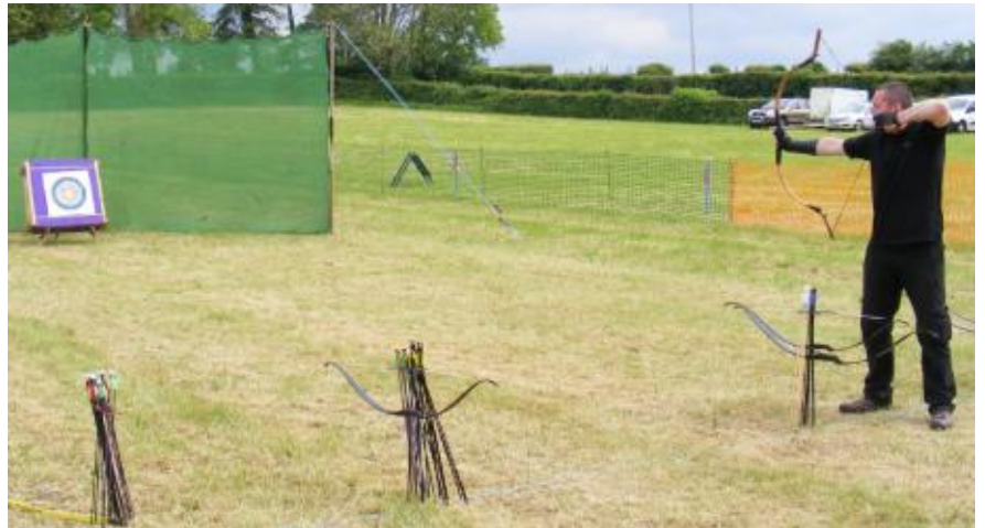
Right: The Holme Bowmen showing off their skills on the top field