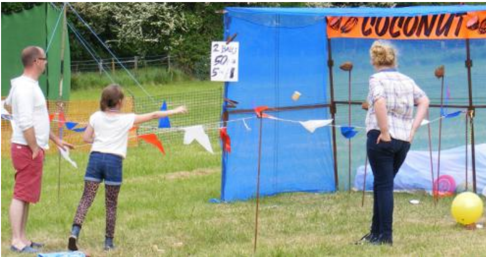
Left: Aiming well on the coconut shy