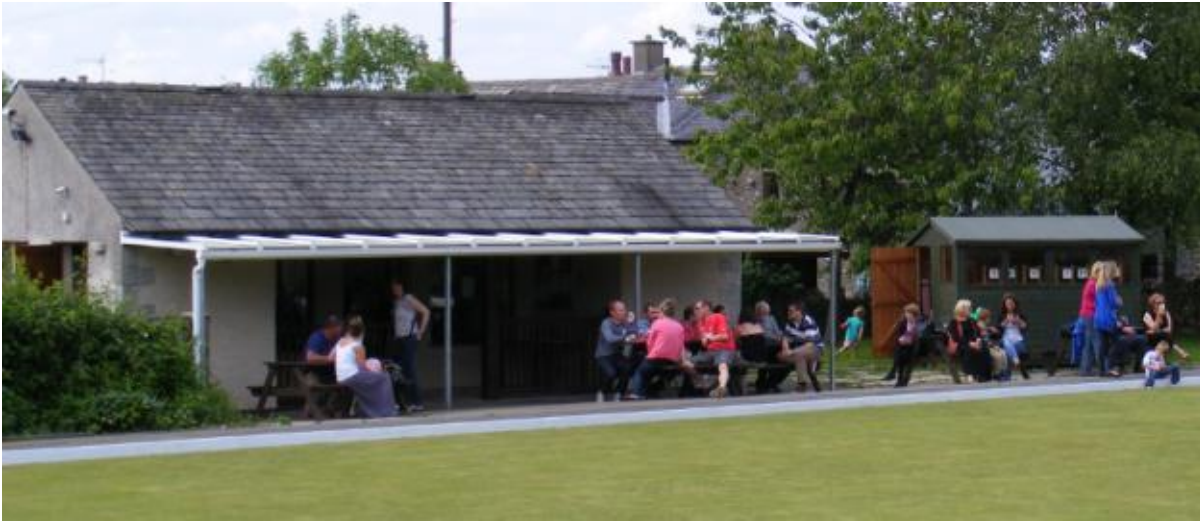
Above: The Bowling pavillion and green saw a lot of activity, as regulars and newcomers enjoyed the sunshine