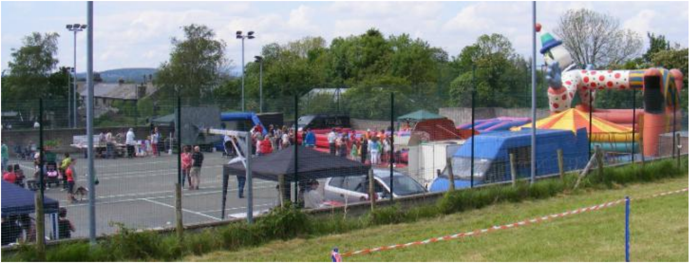
Above: The stalls and games on the MUGA Below Left: The football game Below Right: Riding the rodeo