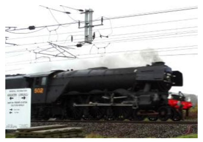
An interesting juxtaposition of old and new, a steam engine on an electrified line!

How many had a nostalgic, if soggy, trip down memory lane at the start of last month, watching the newly refurbished Flying Scotsman thunder past Burton still in her wartime livery of all black?