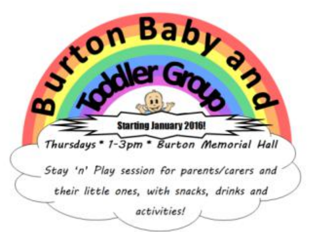
Find us on Facebook!

If you are able to donate a raffle prize please speak to one of the committee members on the details above and we can arrange collection. All donations are gratefully accepted.