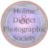
Photo Society Meetings