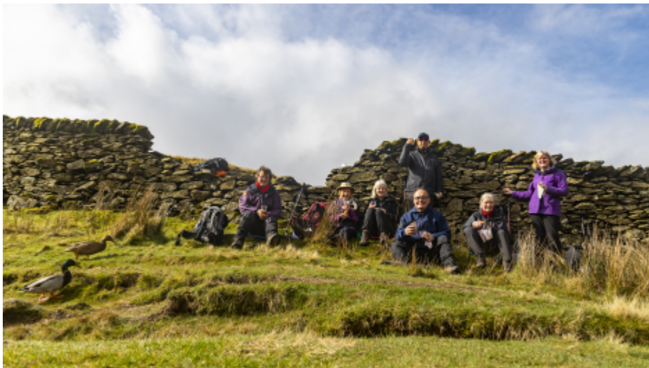
Celebrating in the sunshine by Alcock Tarn - Mallard ducks came to join in!